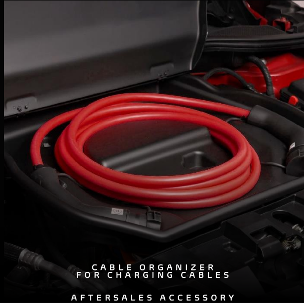
CABLE ORGANIZER FOR CHARGING CABLES AFTERSALES ACCESSORY