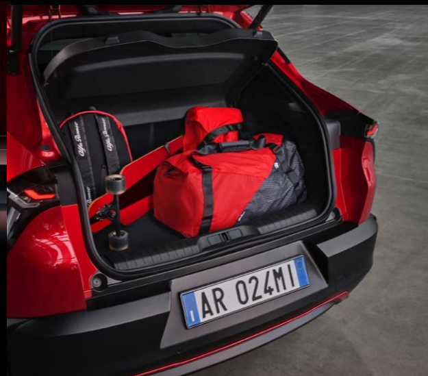
400 LITRES OF BOOT STORAGE