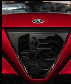
Progresso Scudetto V-Shield