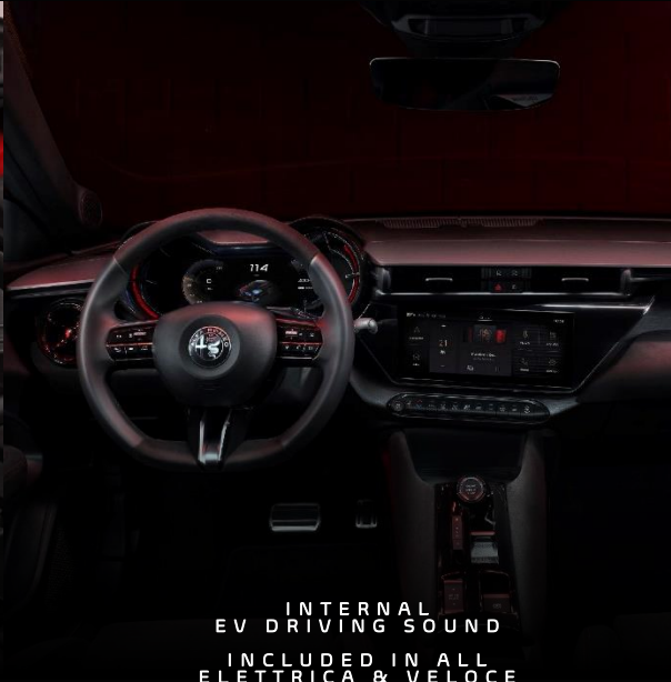
INTERNAL EV DRIVING SOUND INCLUDED IN ALL ELETTRICA & VELOCE