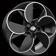
18" Petali Alloy Wheels Diamond Cut