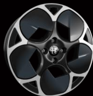
18" Aero Alloy Wheels Diamond Cut