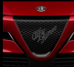
Leggenda Scudetto V-Shield