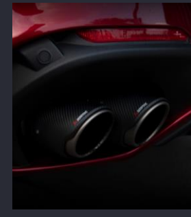
Akrapovic Exhaust System OPTIONAL