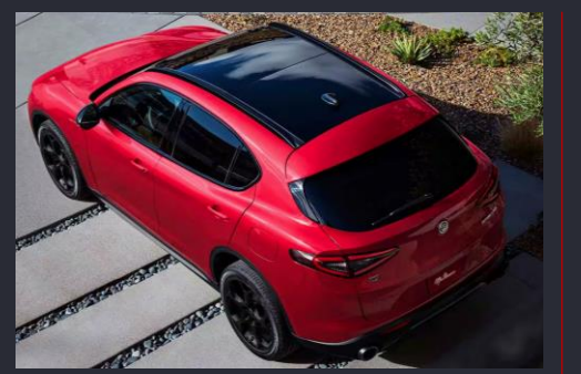
Panoramic Sunroof OPTIONAL