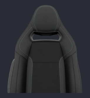
Alcantara and Leather Sparco Sports Seats with Green and Ice Stitching OPTIONAL